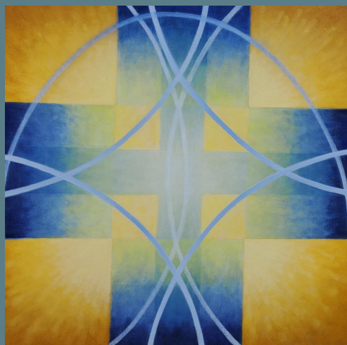
Astonishing Light by Sarah Dwyer 24" x 24" oil on canvas