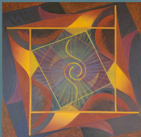
Abstract Painting by Sarah Dwyer 30" x 30" oil on canvas