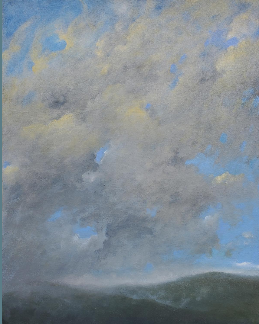
Afternoon Fog by Sarah Dwyer 22" x 28" oil on canvas