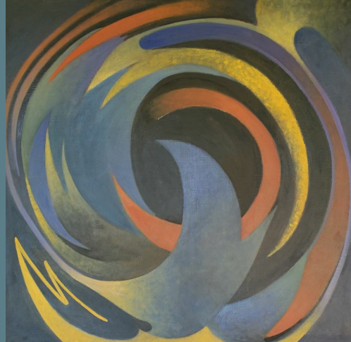
Whirlwind by Sarah Dwyer 30" x 30" oil on canvas

My abstract work starts with a drawing or collage. Sometimes a mandala (a symmetrical structure) is the basis of a painting. Images emerge from a collaboration between my imagination and the materials I work with. For me, abstract painting is a partnership between me and the canvas. It's a give and take. My job is to take my cues from the painting and to render them to the best of my ability."